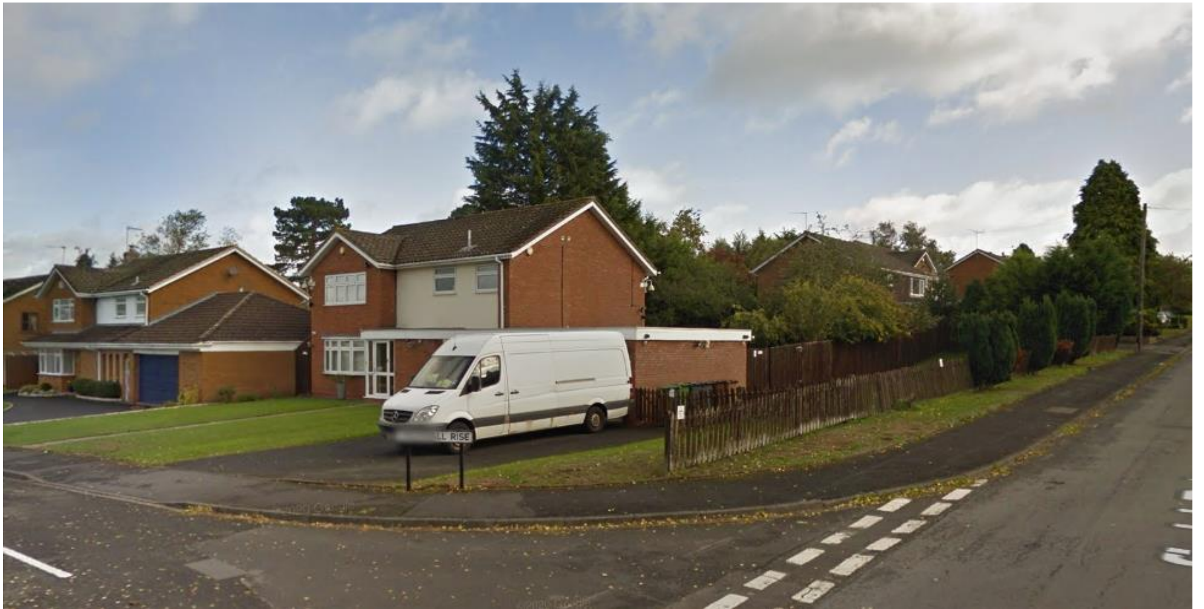
Google Streetview Image 2018