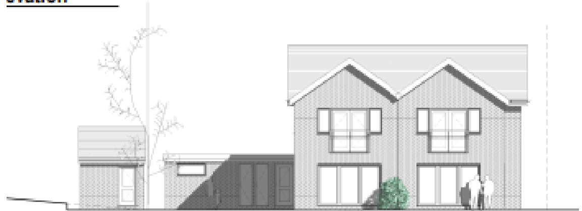
4 Rear Elevation