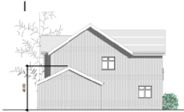
5 Side Elevation 1 1 : 100